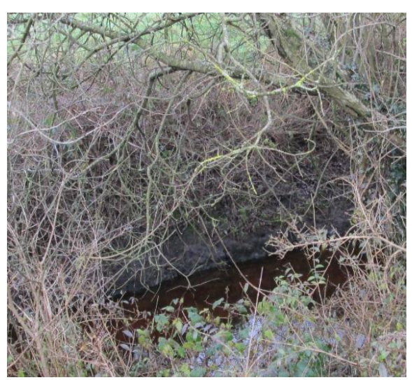
Plate 12. Drainage ditch along field boundary southeast of proposed substation.