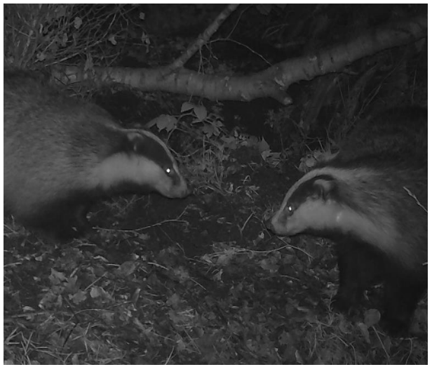
Plate 20. Badgers camera location 1.