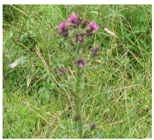
Plate 6. Thistle ( Cirsium spp. ) in a field of an Improved agricultural grassland (not to scale).