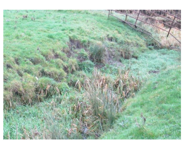
Plate 14. Drainage ditch discharging directly in to the Figile River south of the proposed cable route.