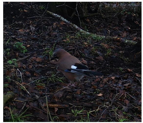
Plate 21. Jay (Garrulus glandarius) camera location 1.