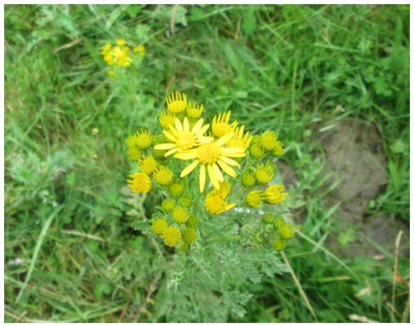
Plate 1. Ragwort ( Jacobaea vulgaris ) with cow dung present a field of an Improved agricultural grassland (not to scale).