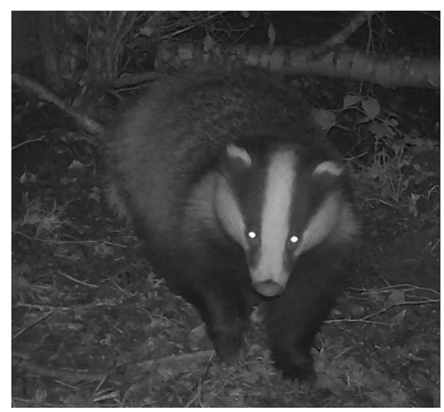
Plate 18. Badger (Meles meles) camera location 1.