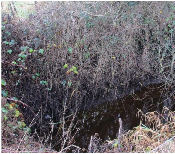
Plate 11. Drainage ditch along field boundary southeast of proposed substation.