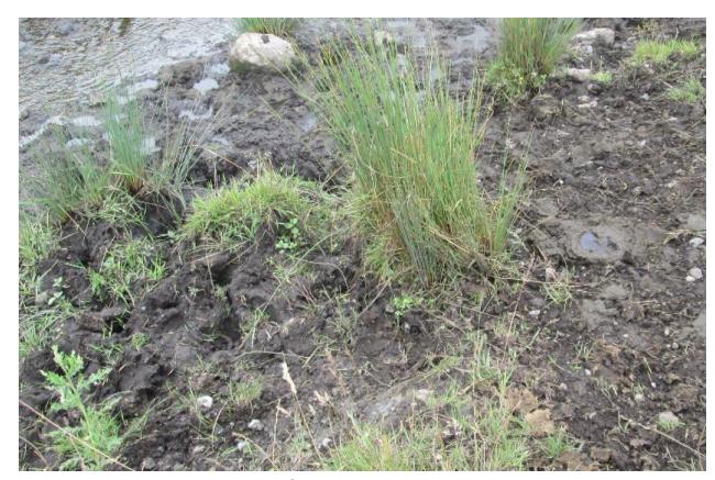
Plate 9. Poaching of the soil beside drainage ditch south of proposed substation.