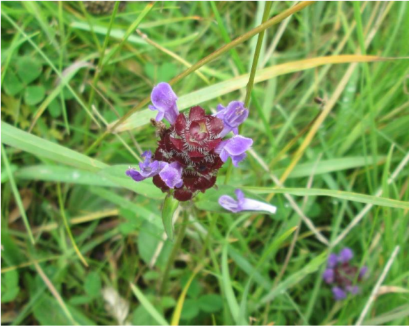
Plate 2. Self-heal ( Prunella vulgaris ) in a field of an Improved agricultural grassland (not to scale).