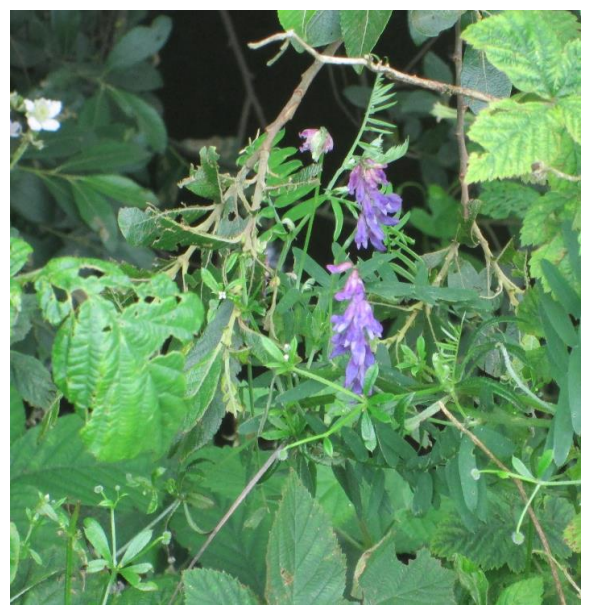
Plate 3. Vetch sp. ( Vicia spp. ) with Bramble ( Rubus fruticosus ) and Cleavers ( Galium aparine ) (not to scale).