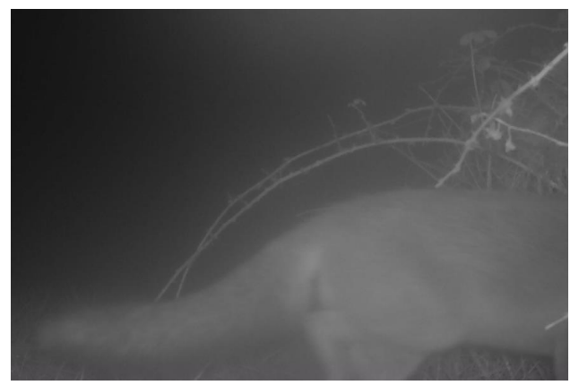
Plate 23 . Fox entering scrub camera location 2.