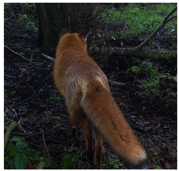
Plate 17. Fox (Vulpes vulpes) camera location 1.