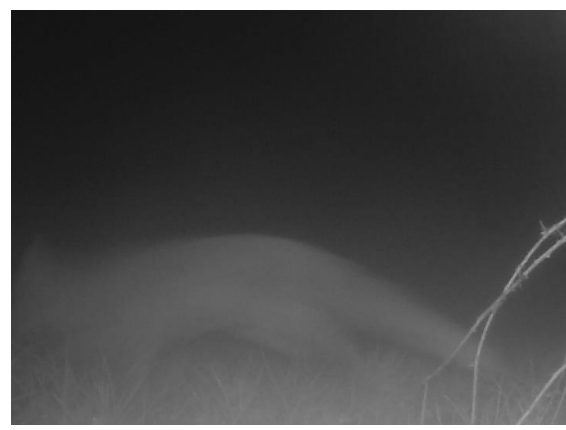
Plate 24 . Fox exiting scrub camera location 2.