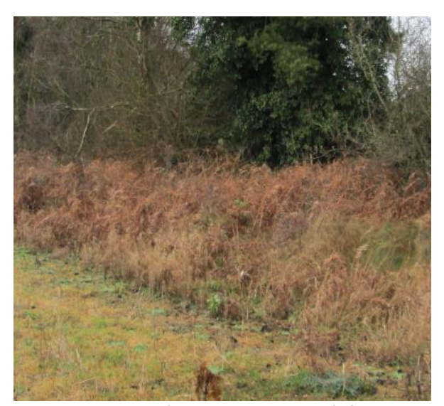
Plate 8 . Bracken ( Pteridium aquilinum ) fringing a field of an Improved agricultural grassland.