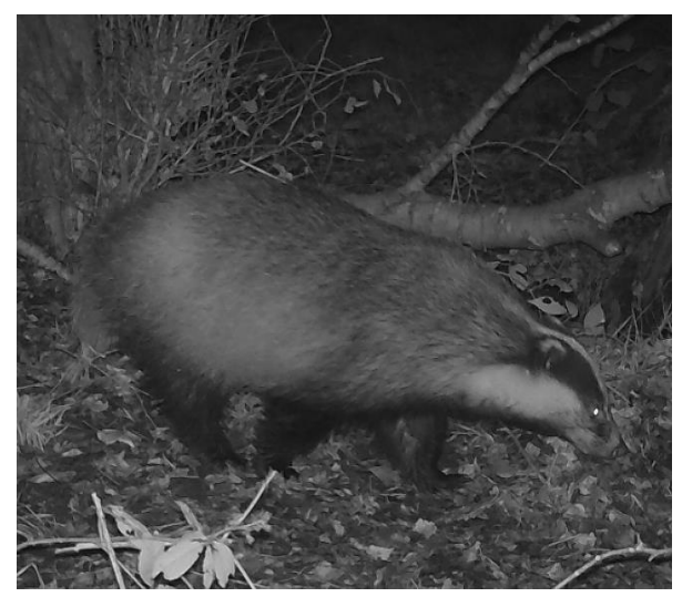
Plate 19. Badger camera location 1.