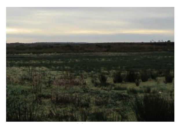
Plate 15. Rushy part of field leading towards cut over bog to the southwest of the proposed development.