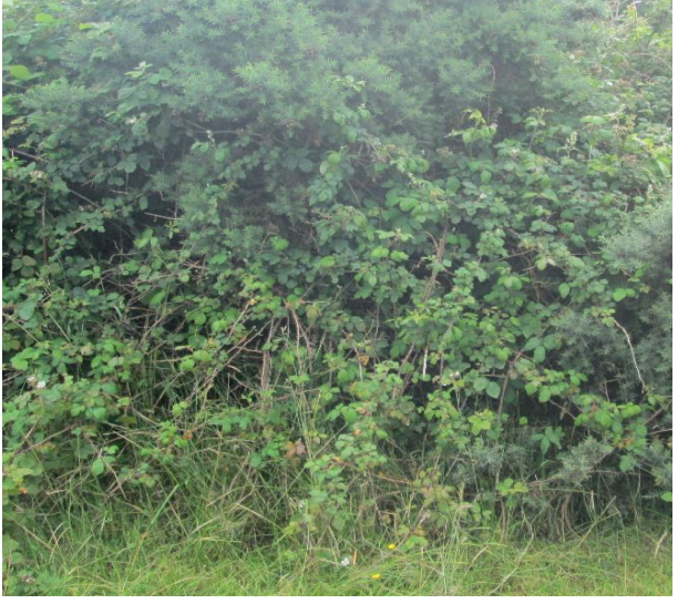
Plate 7. Hedgerows and scrub with Hawthorn ( Crataegus monogyna ), Gorse ( Ulex europaeus ) and Brambles ( Rubus fructicosus ).