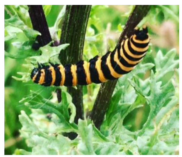
Plate 29. Caterillar of Cinnabar moth ( Tyria jacobaeae ) on food plant Ragwort (not to scale).