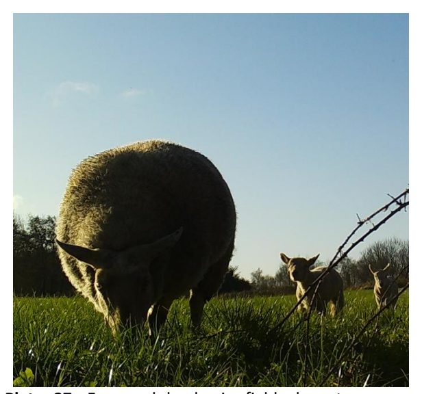
Plate 27 . Ewe and lambs in field close to camera location 2.