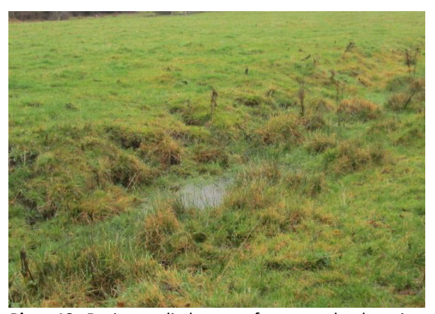
Plate 13. Drainage ditch east of proposed substation heading in a southerly direction.