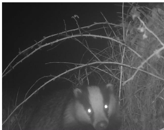
Plate 26. Badger about to enter scrub camera location 2.