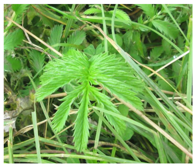
Plate 5. Silverweed ( Potentilla anserina ) close to a drainage ditch (not to scale).