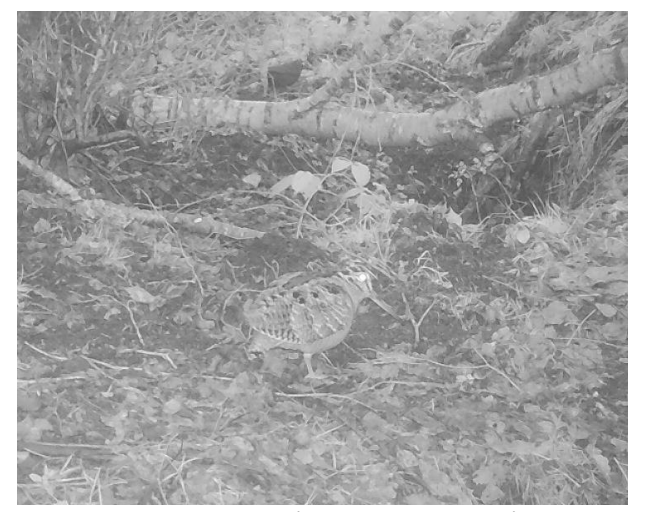
Plate 22. Woodcock ( Scolopax rusticola ) camera location 1.