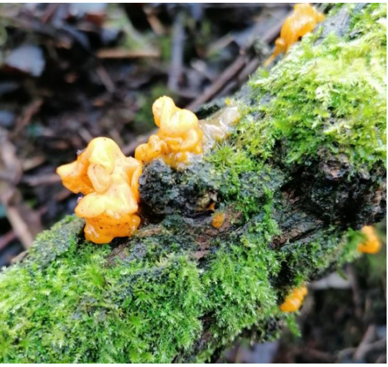
Plate 30. Yellow brain fungus ( Tremella mesenterica ) on a piece of rotting wood beneath a hedgerow (not to scale).