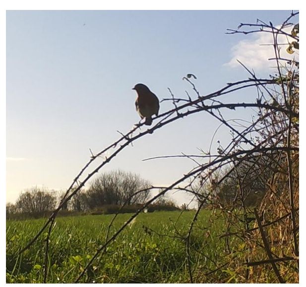
Plate 28 . Robin perched on Bramble camera location 2.