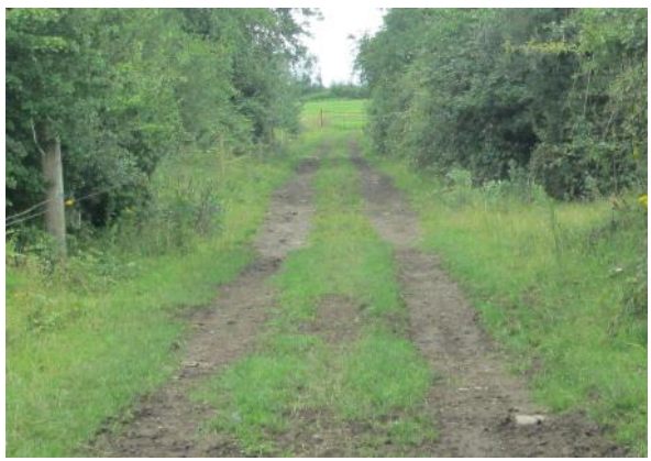
Plate 10 . rough track leading south adjacent to Figile River.