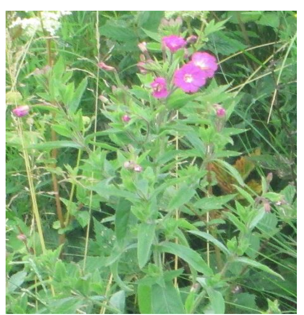
Plate 4 . Great willowherb ( Epilobium hirsutum ) close to a drainage ditch (not to scale).